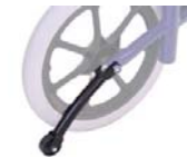
Anti tippers (req'd with no back and drag brake options)