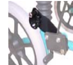
No Roll Back Brakes