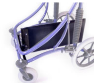
Midline leg separator