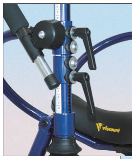
Quickly and stepless adjustment of the height of the trunk support and the seat.