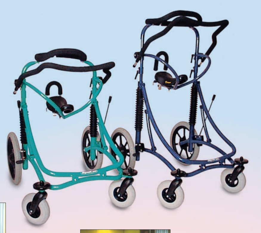
MEYWALK® 2000 Medium