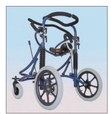
MEYWALK® 2000 Medium.