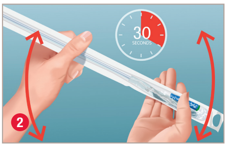
Wet the catheter: Holding the package, use a seesaw motion to tip the package up and down 6 times to wet the catheter. Wait at least 30 seconds from when you wet the catheter to use it.

Release the water: Without opening the package, fold the water pack in half. Apply pressure to the water pack to release the water (burst pack) either by squeezing the folded pack between your thumb and forefinger or pressing it down against a firm surface