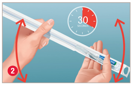
Wet the catheter: Holding the package, use a seesaw motion to tip the package up and down 6 times to wet the catheter. Wait at least 30 seconds from when you wet the catheter to use it.