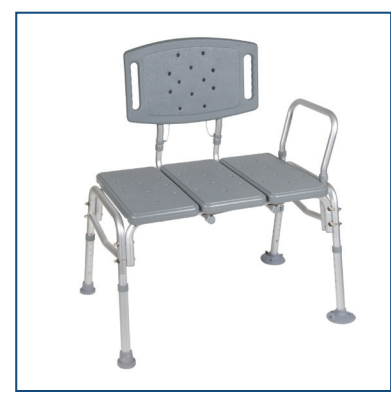
Weight capacity: 500 lbs (227 Kg)

The transfer bench must be level to avoid damage or injury.