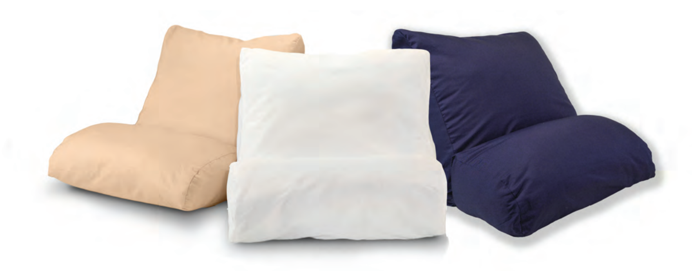
For covers and more unique products please visit www.contourliving.com