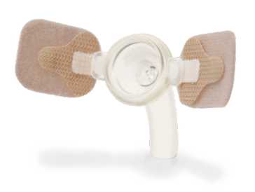
Provox LaryTube with Provox LaryClip