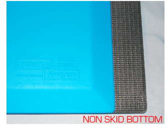
NON SKID BOTTOM