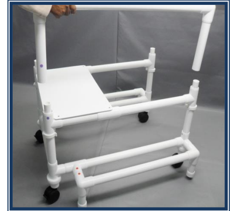
INSERT SIDE RAILS BY MATCHING COLOR CODED DOTS.