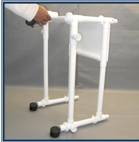
INSERT CASTERS --PLACE BRAKE WHEELS ON THE REAR OF THE WALKER