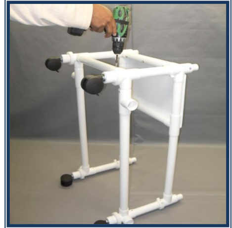
SECURE CASTERS WITH SCREWS PROVIDED USING PILOT HOLE AS REFERENCE