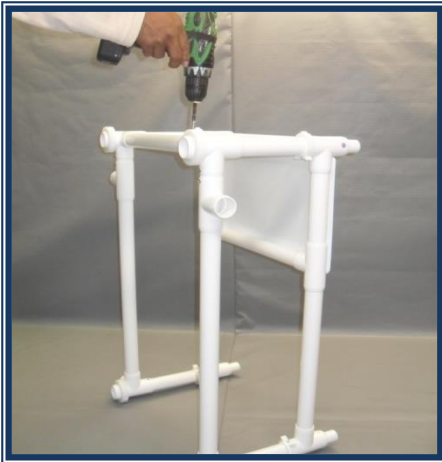
REMOVE SCREWS FROM REINFORCEMENT RINGS