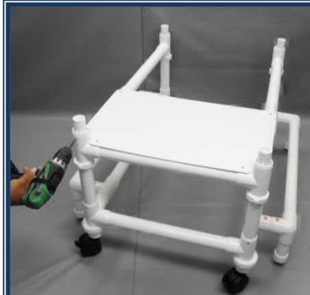
REMOVE SCREWS FROM AREA BY SEAT SECTION